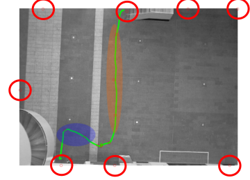
Figure 3: Study of a challenging trajectory. The initial part (blue area) clearly entails an implicit intentionality towards destination D_6 . Before arriving, the subject stops and then changes its intentionality (orange area) to the destination D_2 .

The method has been validated using the Edinburgh Informatics Forum real-world database of human walking in a public scenario. The results show that our predictor functions works well for these scenarios and surprisingly what is more important is that the predictor showed an acceptable performance when evaluating complex trajectories, such as destination changes, unexpected behaviors and other abnormalities, that typical methods might fail to identify while the curvature criterion rapidly recognizes the new intentionality. Specially interesting is the hypothesis of human navigation strategy as a consequence of goal achieving of consecutive destinations.