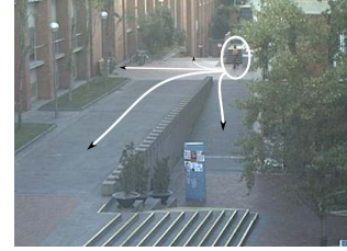
Figure 1: Example of human motion prediction, a step towards human-robot intelligent interaction.

The study of human motion patterns may be divided in two major categories of methods. The first set of methods is more related to a classification problem, like [2] and [5] where a primitive trajectory is built in order to predict. The second set of methods, [3] for instance, propose a human motion prediction based on goal-oriented intentionality.