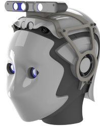
Fig. 2: Detail of the REEM head when equipped with the depth device.

The head contains several sensors that allow the robot perceive the world in the direction it is looking (cameras, microphone and sonars). It also contains a pair of round leds that show the power status of the robot. As a special feature for the Robocup competition, the head of the robot has been equipped with a depth sensor using a special structure that adapts the sensor to the head on a fashionable way.