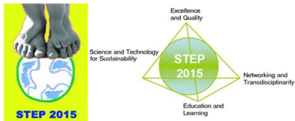
Fig. 1 STEP logo and key values for the Program

lessons learnt in the pilot experience (2011-12 and 2012-13). Fourth, the program is going to be applied to all UPC Schools and departments (2013-14 and 2014-15). Fig. 1 shows the logo that STEP program has been using in the promotion plan and even some merchandising has been created with it (pens, T-shirts...) together with some brochures containing information (Fig. 2) for advertising the plan among students and faculty. The key values that STEP program want to promote are reflected in Fig. 1 (right).