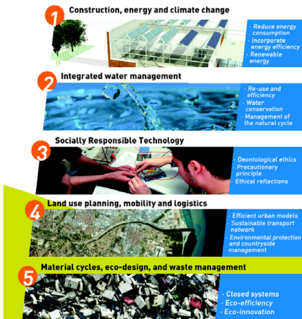
Fig. 2 UPC Sustainable 2015 Plan Challenges

This paper presents the STEP program, its implementation, development and evaluation highlighting the process recommendations to export the program to other Universities. Specifically the full process will be explained and the results up to the third phase will be shown, where the collected experience already covers ten technological schools of UPC (over 16 schools). This third phase has been the most exciting and creative one and for this reason authors want to share the enriching experience, the fourth phase (which is just beginning this academic year) will consist in enlarging and replicating the third phase. In this period, the basis of a methodological set-up has been developed preparing formative courses for lecturers in Education for the Sustainability in order the faculty are able to