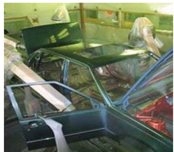
Fig. 5 Robotics processes in automobile production