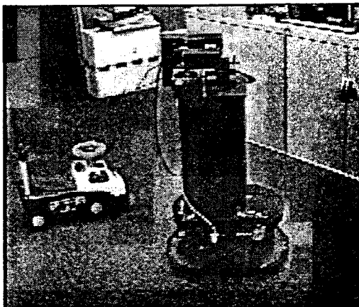
Figure 1. Marco playing with a child toy.

In the pictures below, the robot "Marco" is used as a testbed for the development of the navigation algorithms using computer vision. Also, all the images for automatic learning are obtained from the cameras mounted in the stereoscopy head at the top of the robot.