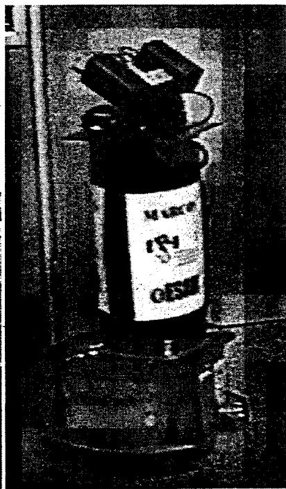
Figure 2. Marco and its head.