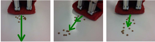
(a) Move to container (b) Join 2 groups (c) Group scattered