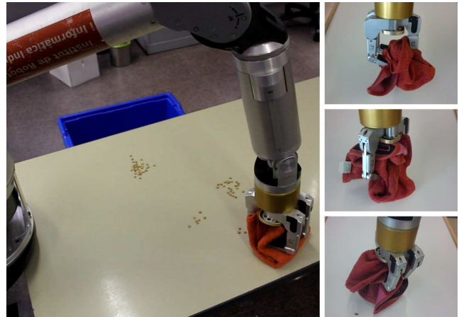
Figure 1: On the left the WAM robot arm is cleaning lentils from a table to a container. On the right three different grasps of the textile used for cleaning, each one leading to different behaviours of the cleaning actions.

executions until good rules are obtained, but we aim to finish the task quite fast after a few action executions. We propose starting with very simple handcrafted rules and update them with a new heuristic based on the m -estimate (Cestnik 1990) to get more accurate rules that will perform quite well after a few executions. This is intended for the initial steps until enough experience is obtained to apply more complex methods that can refine the rules with more details. The criteria of the number of actions executed and time to complete the whole task will be used to measure the success of the method. A more simple approach, like a reactive action execution, will not provide a proper solution as the combination of different actions cannot be taken into account.