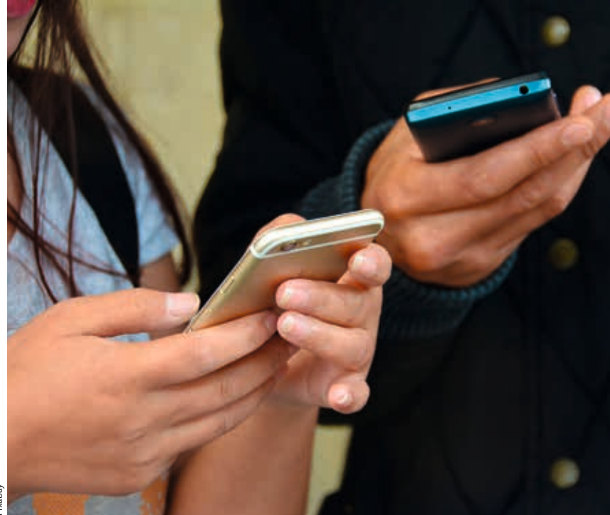
Many social network users, especially young people, are not aware of the potential misuse of the information they share, which can be used to bully, blackmail, or intimidate them, or can simply play against them when they are looking for a job.

Little by little, so-called social robots are entering our everyday environment, assisting elderly or disabled people, as guides at festivals and in museums, or even as babysitters and teaching assistants, among other tasks. Above, an Eldertoy test session with elderly people, focused on improving the psychosocial, affective, and cognitive abilities of its users. The picture on the right shows a workshop where children can learn to program the NAO robot (Softbank Robotics).