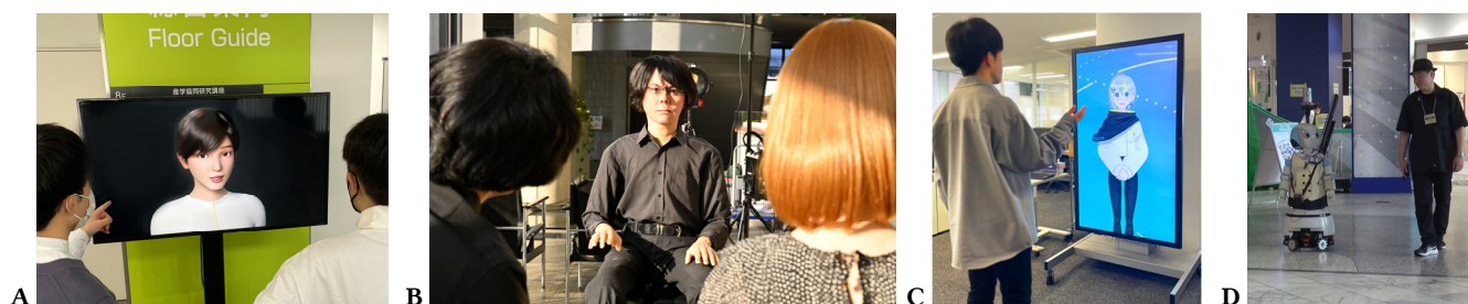
Figure 1. Avatar robots can have different embodiments, functionalities, representations, and social interactions, for example, a virtual agent (left-most picture) interacting with people, a humanoid avatar robot (left-mid) having daily conversations, a computer-generated anime-style avatar (right-mid) replacing information booths, and a mobile humanoid robot (right-most) working as a tour guide.

Hiroshi Ishiguro Osaka University, Japan ishiguro@irl.sys.es.osaka- u.ac.jp