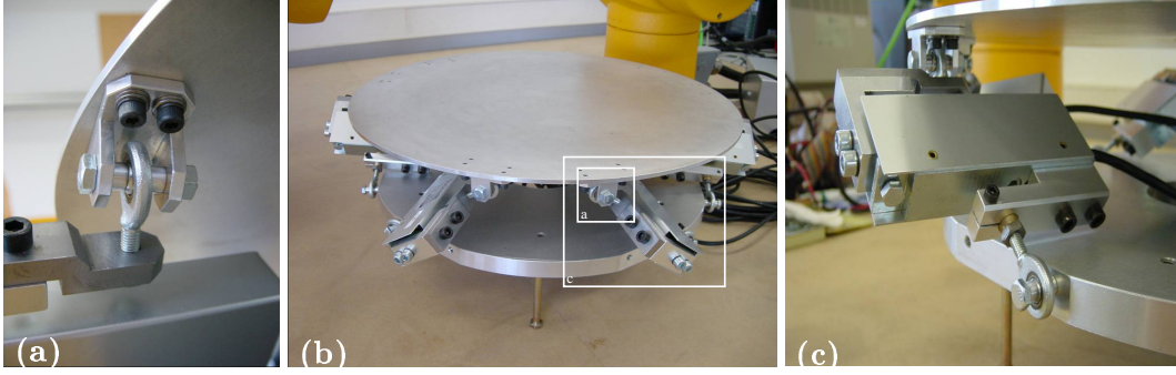
Figure 2: Sensor prototype (b), details of the ball-and-socket joints (a) and the load cells (c).

b = 1/\sqrt{2} . One can see that, with this \mathbf{E}_p , and arranging the legs as depicted in Fig. 1-right, we obtain a sensor where \mathbf{E}_l nearly defines a hypersphere and is hence close to optimal. Actually, this makes all leg forces lie in the interval \pm 7.5 N and, thus, the installed load cells must be able to work within this range. A non-negligible platform weight just changes this interval slightly. It only shifts the ellipsoids for \mathbf{w}_p and \mathbf{f} away from the origin, keeping their axes' lengths. For a weight of 20 N in our case, we get an actual interval of leg forces of [-2.4, 13.6] N. A low-cost load cell compatible with this range is Utilcell's 105 model, whose maximum supported force and measurement error are \pm 20 N and \pm 0.0039 N, respectively.