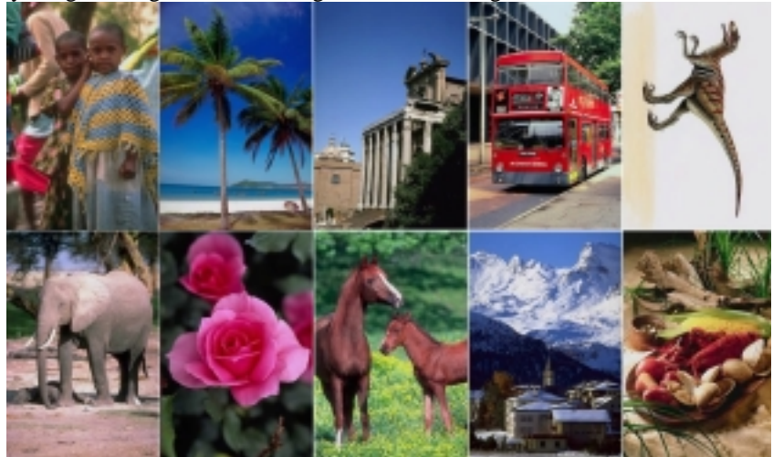
Figure 2. Ten images of WANG database. One of each class.

Our test database was composed by 200 images from the WANG database (20 images for each class). In Figure 2 we can see one representative image of each class. The query set was composed by 20 images (2 images for each class) and the database set was composed by the other 180 images (18 images for each class). We decide that the query image belongs to a class using the 5 nearest neighbours criteria.