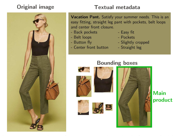
Figure 1: Overview of our proposed method: from a fashion e-commerce image and its associated textual metadata, we extract several bounding box proposals and select the one that represents the main product being described in the text.

In this work, we propose to leverage this metadata information to select the most relevant region in an image, or more specifically, to detect the main product in a fashion image that might contain several garments. This allows us to subsequently train specific product classifiers, which do not need to be fed with the whole image. Additionally,