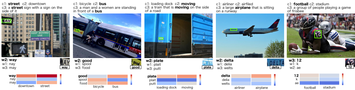
Figure 2: Examples of candidate re-ranking using object (c1), place (c2), and caption (c3) information. The delta-airliner relation which frequently co-occurs in training data is captured by the overlap layers. The 12-football pair shows a relatedness between sports and numbers.

over time, and it allows the model to refer to specific points in the sequence when computing its output. However, in this case, the attention attends the wrong context, as there are many words have no correlation or do not correspond to actual words. On the other hand, USE-T seems to require a shorter hypothesis list to get top performance when the right word is in the hypothesis list.